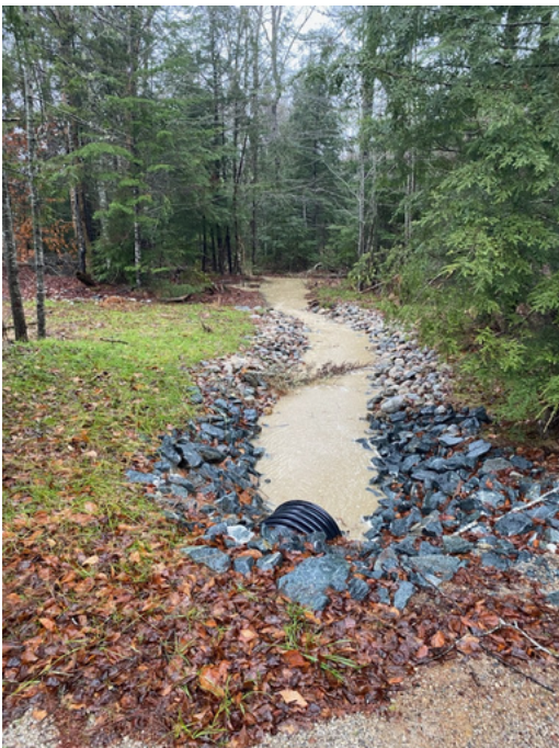
LEFT: New culvert on Cousins Road diverting stormwater towards BMP (Best Management Practice) infiltration.