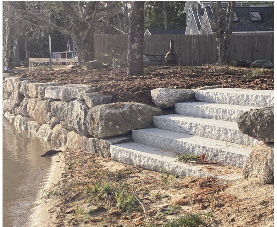
ABOVE: Public beach renovation in progress with a new stone retaining wall, granite steps, and picnic area.